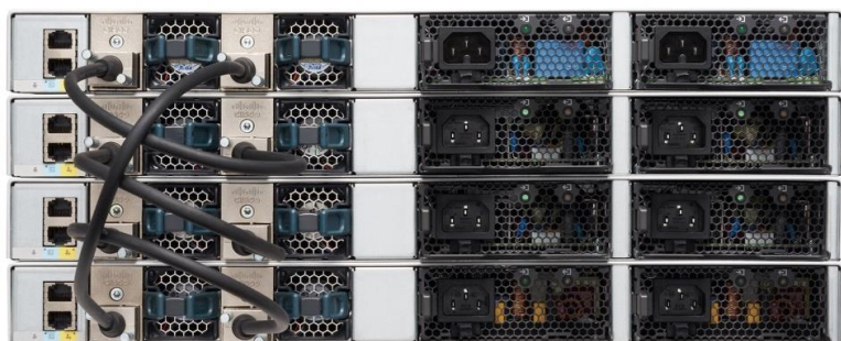
Figure 4. Cisco Catalyst 9200 Series Switch stacked units