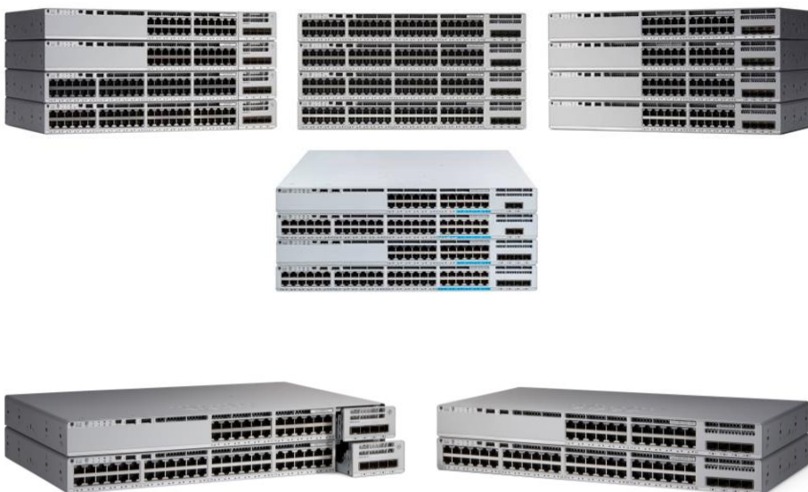
Figure 1. Cisco Catalyst 9200 Series switches

The Cisco Catalyst 9200 Series is made up of modular (C9200) and fixed (C9200L) switch models.