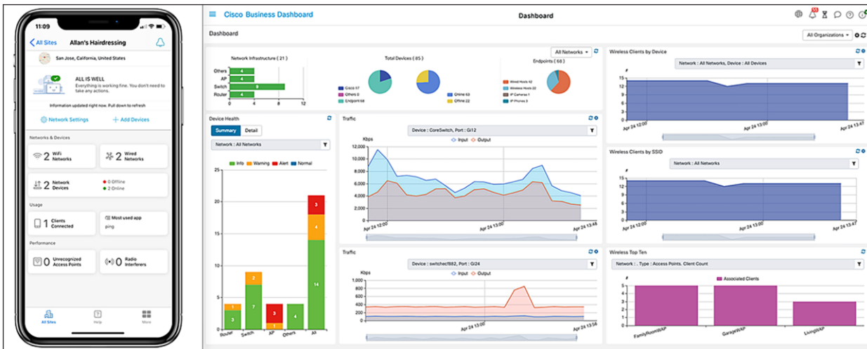
Figure 1. Cisco Business Dashboard and Cisco Business mobile app

The Cisco Catalyst™ 1200 Series Switches are affordable smart switches designed and built for small and medium-sized businesses. Managed through the Cisco® Business mobile app or dashboard, the switch portfolio provides a simple and reliable experience.