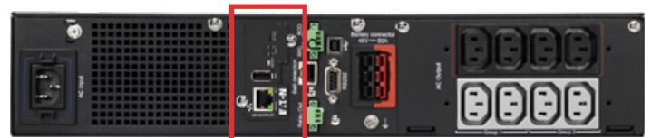
Eaton Gigabit Network Card installed in a UPS

For more information, please visit: Eaton.com/Network-M3